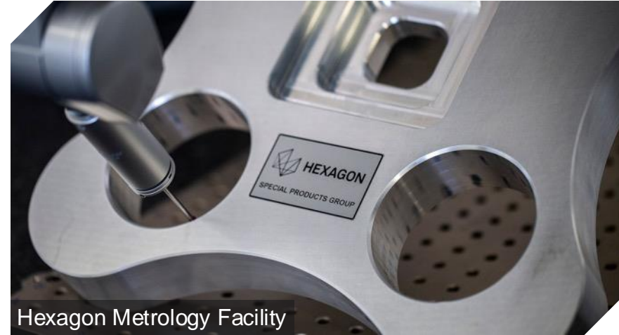
Hexagon Metrology Facility