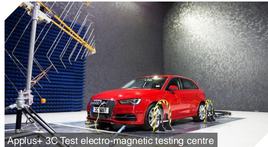
Applus+ 3C Test electro-magnetic testing centre