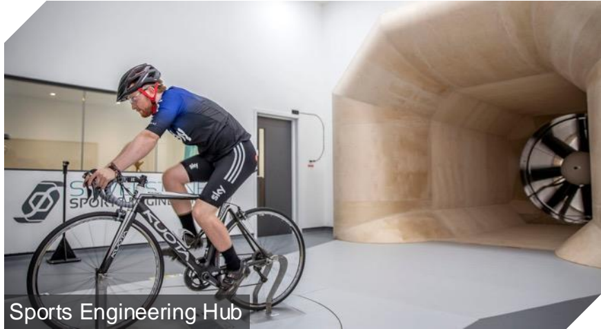
Sports Engineering Hub